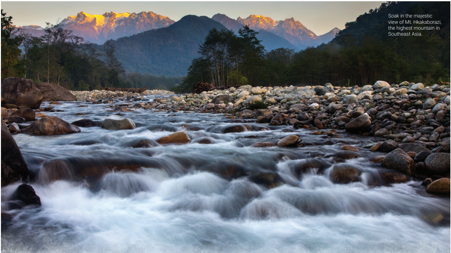
Soak in the majestic view of Mt. Hkakaborazi, the highest mountain in Southeast Asia.